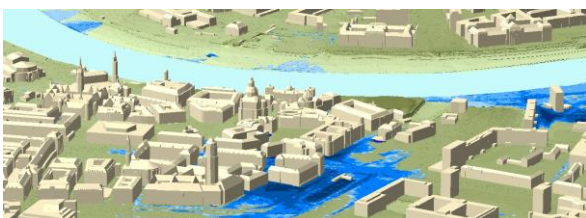
Flooded areas in the assessed area