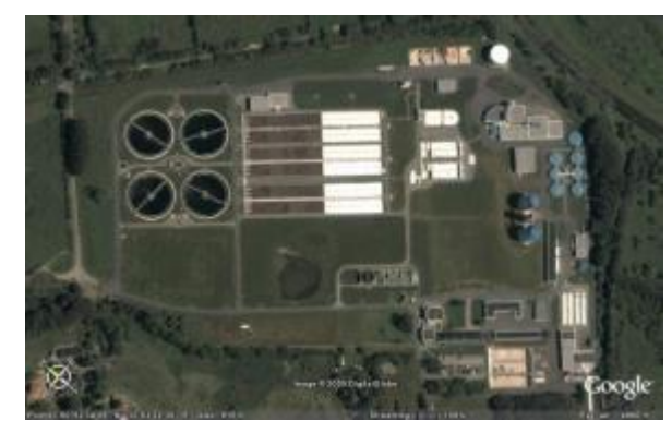
Aerial picture of the WWTP Chemnitz

input data to predict the hydraulic situation in the sewer system and on the plant during heavy rain events. In the second project phase control concepts are implemented and tested on the WWTP of Chemnitz. Cooperation partner of the project is the Institute for urban water management at the Technical University of Dresden.